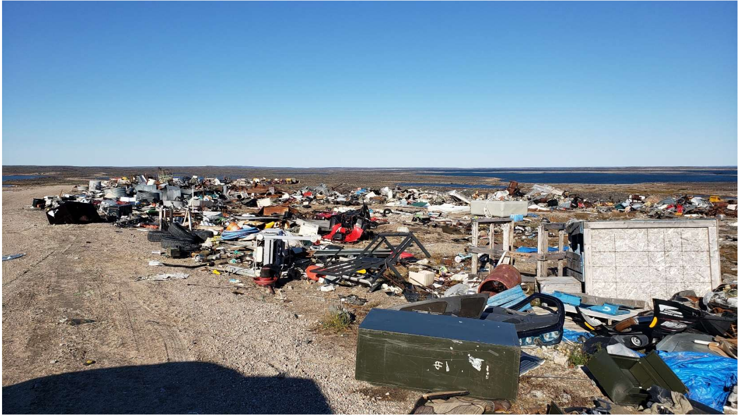
Description: Road dividing domestic waste (right) and bulk waste (left), image facing North-West.